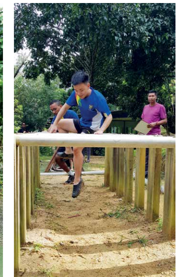
Obstacle challenges that push students to step up for themselves and face the challenge in front of them.