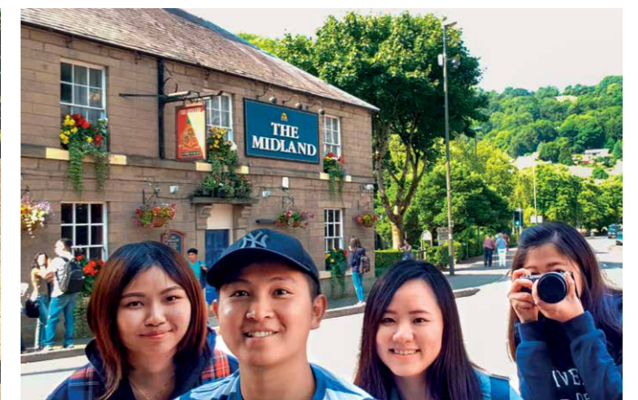
A photo after lunch at a quaint English pub (background) in Matlock Bath, Derby.