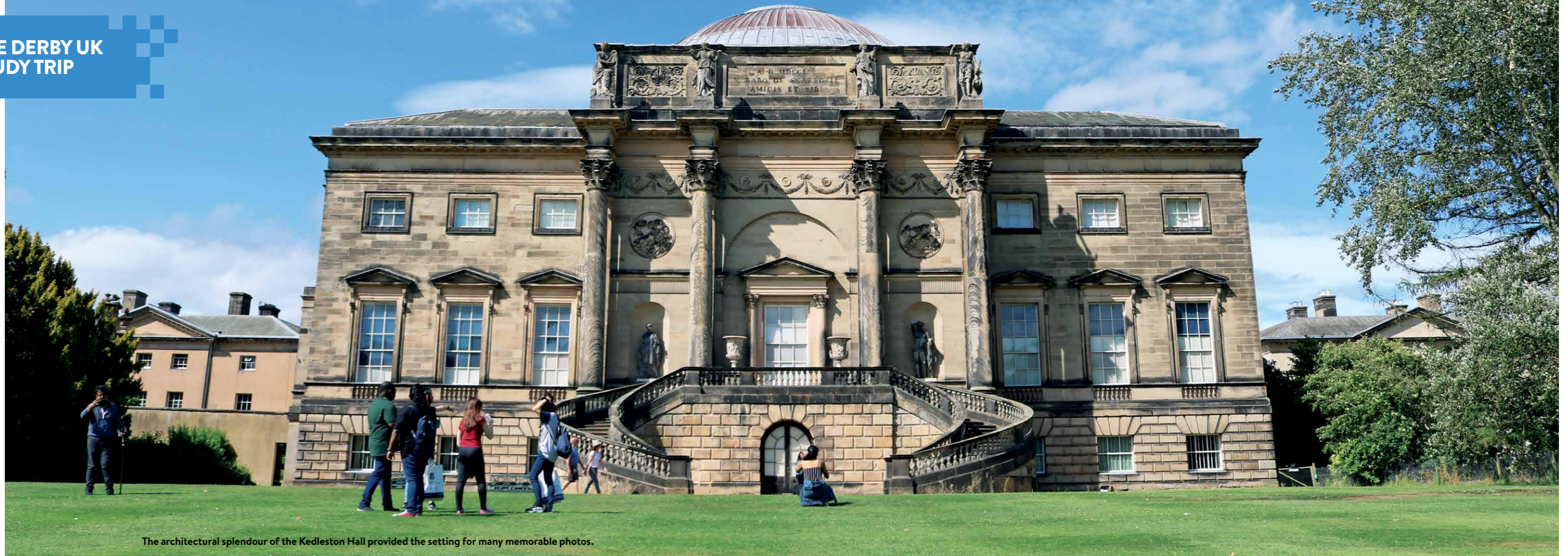
The architectural splendour of the Kedleston Hall provided the setting for many memorable photos.