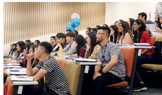
Students focusing on the welcoming brief by the University.