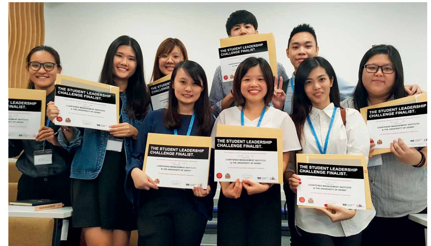
Finalists in the Chartered Management Institute-University of Derby Student Leadership Challenge programme at the University's International Summer School, UK.

At the commencement of each module, students will be provided the assessment mode and weightings for the module. Most modules have several points of assessment, which may include assignments, tests, projects and final examinations.