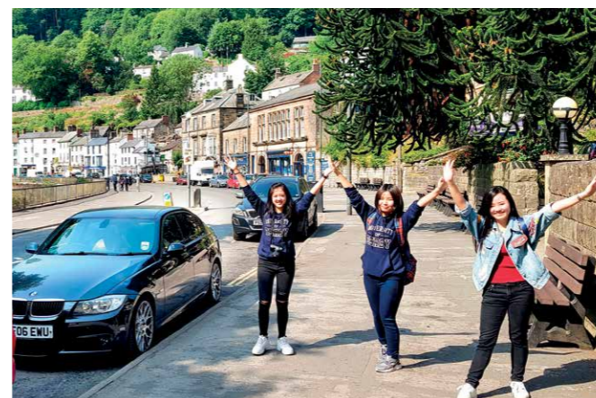
Happy to enjoy the natural beauty of Matlock Bath, Derby.