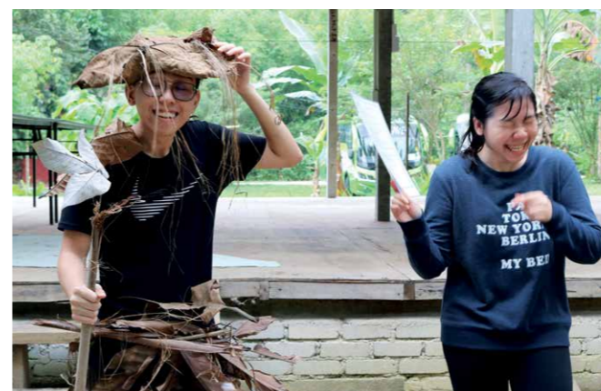
Marketing product using limited resources by DOMS students.