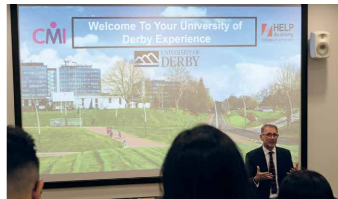
Welcoming brief by the CMI representative.