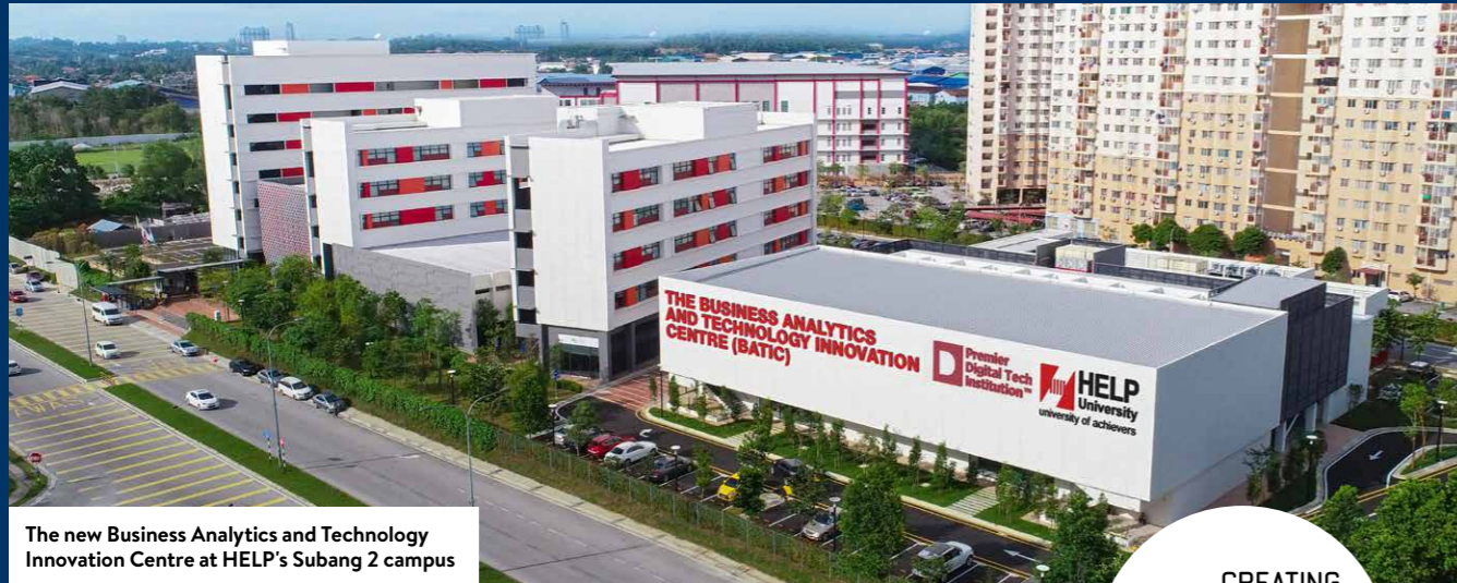
The new Business Analytics and Technology Innovation Centre at HELP's Subang 2 campus