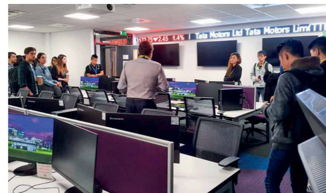
A first-hand look at the workings of the Bloomberg Financial Market Lab which services financial institutions worldwide.