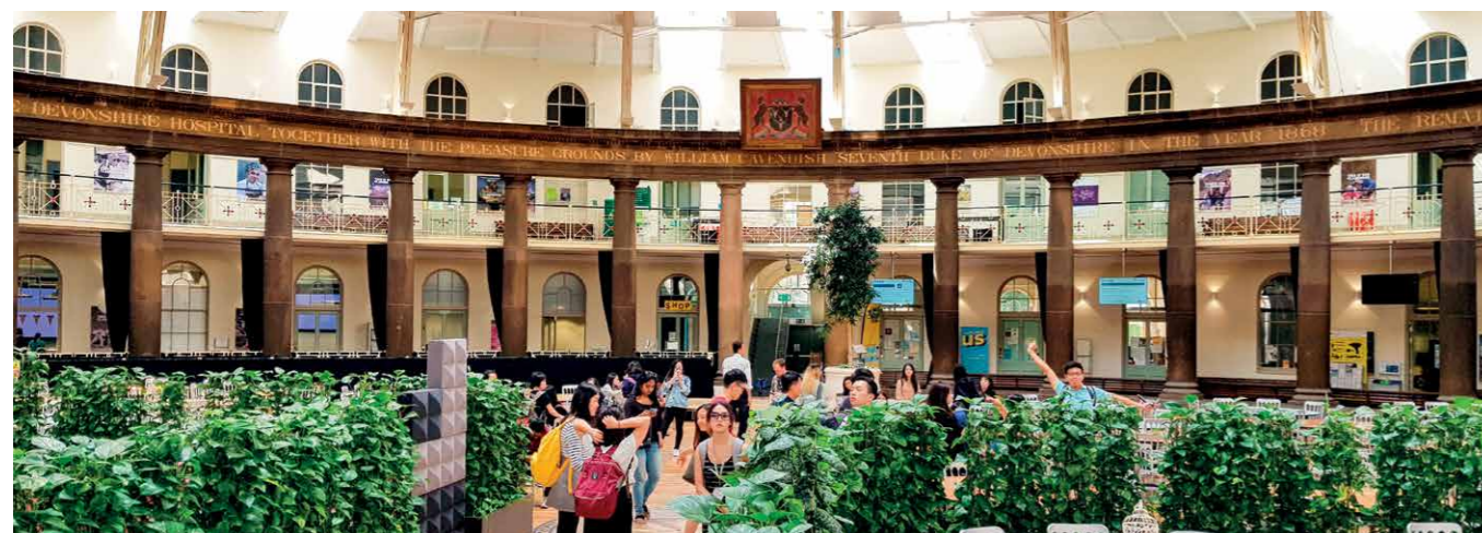
The Devonshire Dome in Buxton Campus - a stunning heritage project - now hosts the UK's premier banquets and events.